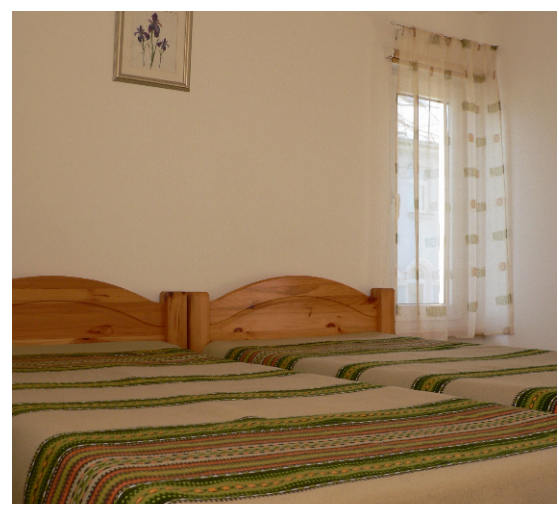
Esta sutara Viasu pama MATTA foto arbivo

Guest house Maija is located in a quiet area of private houses, 5 min. walking distance from the Olympic Center "Ventspils" and 7 min. from concert hall LATVIA. It offers self-catering accommodation, free WiFi in public areas and private parking.