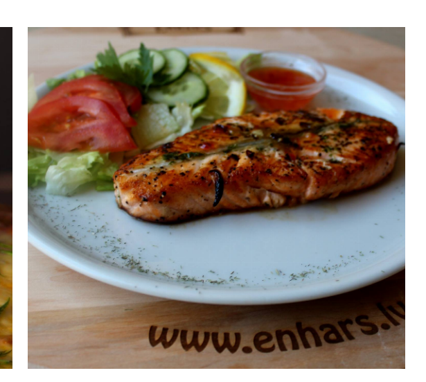
rs Kafejnīcas Dolce Vita foto arhīvs

Café-Pizzeria Dolce Vita is located in the very heart of one of the most beautiful cities in Latvia – Ventspils (address Kuldīgas Street 20).