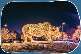
11. SARKANMUIŽAS MEADOW Floral sculpture "Flower Cow" dressed up in winter lights.