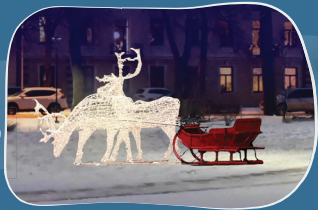
9. JAUNPILSĒTAS SQUARE An illuminated pair of reindeer pulling a sleigh.