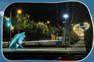
6. LAIKRAKSTU ALLEYWAY Arrangement of illuminated umbrellas.