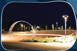
12. SCIENCE CENTRE "VIZIUM" "Arc of light of a shooting star".