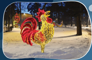
7. CHILDREN'S TOWN Chinese zodiac signs and Christmas tree full of stars.