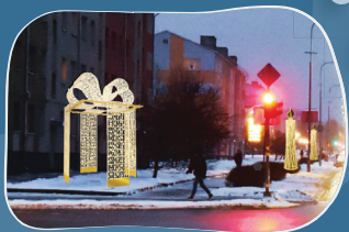
10. LIELAIS PROSPEKTS Large candles and a gift box made of Christmas lights.