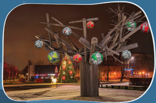
13. PĀRVENTA CENTRE Main Christmas tree of the right bank