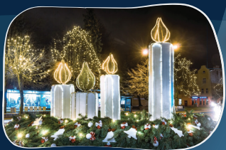
4. KULDĪGAS AND GANĪBU STREETS A candle will light on the Advent wreath in the Hay Market Square every week leading up to Christmas.