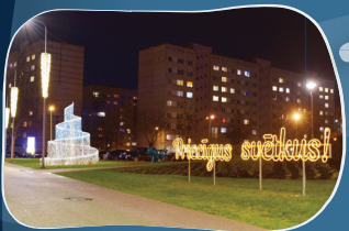
8. INŽENIERU STREET Light decorations.