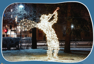
5. DZIRNAVU SQUARE Musical angels.